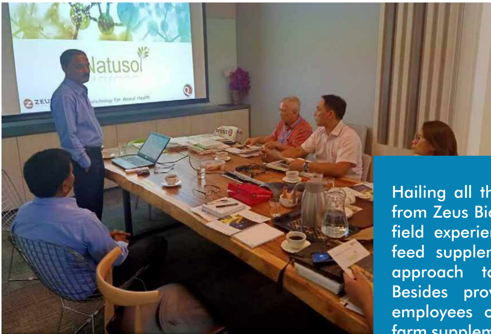
Sharing session in between Zeus & Sunzen representative